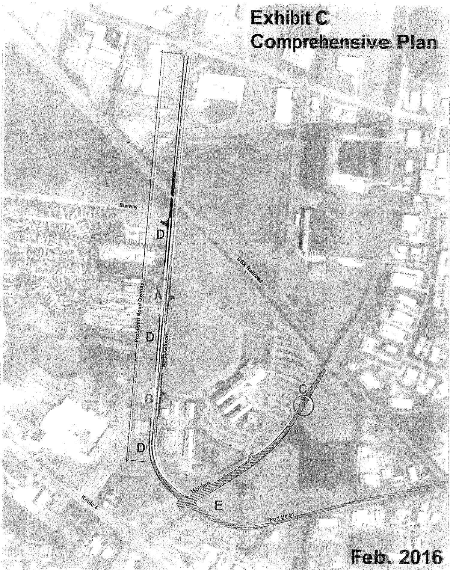
Exhibit C Comprehensive Plan